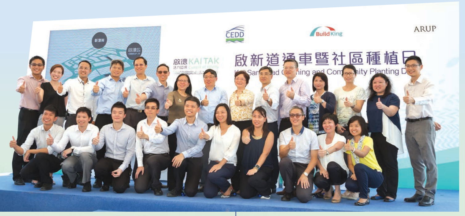
土木工程拓展署署長與九龍拓展處同事合照 Group photo of Director of Civil Engineering and Development with colleagues of the Kowloon Development Office