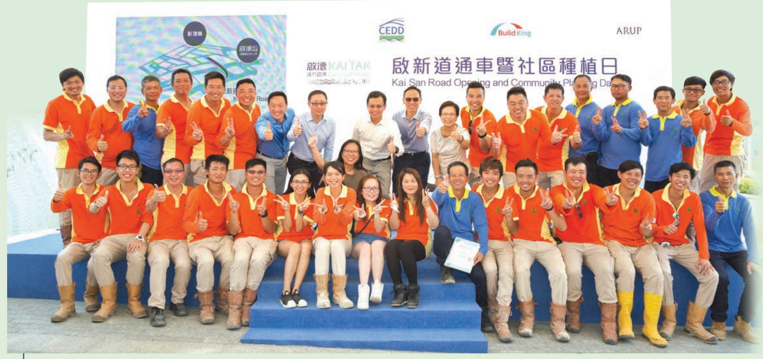
工程團隊合照 Group photo of project teams