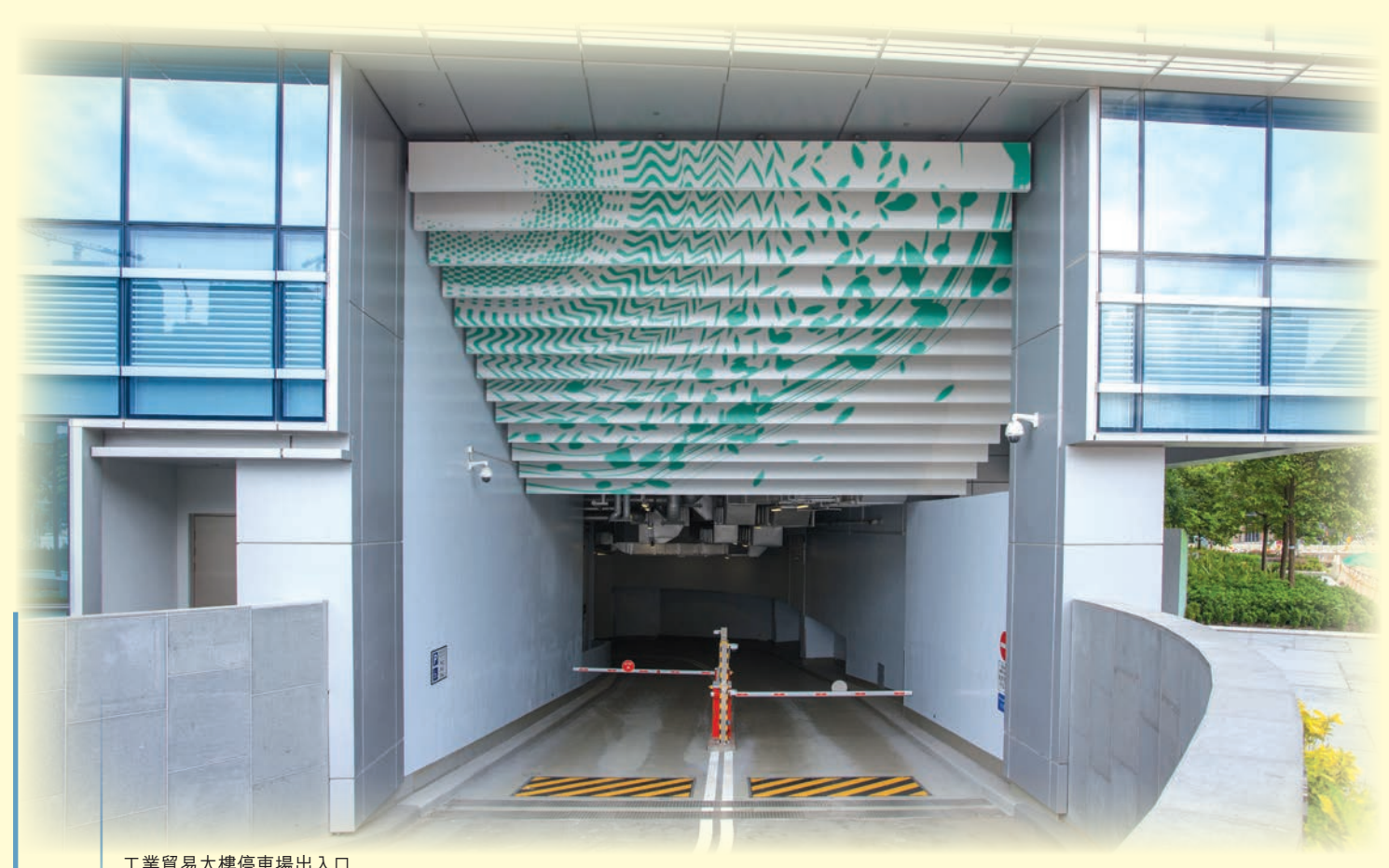
工業貿易大樓停車場出入口 Car park entrance/exit at Trade and Industry Tower

The new carriageway, Kai San Road, around 570m in length, is one of the important infrastructures in the KTD Area. It runs across Prince Edward Road East and connects Concorde Road in Kai Tak and Tsat Po Street in San Po Kong. As the name suggests, Kai San Road combines the first word of the two districts, "Kai" and "San" to bring out the strong connectivity between the two districts, as well as the synergy generated to the benefits of the residents. Kai San Road was open at 11:59 pm on 16 August.